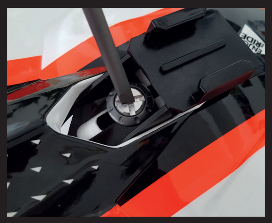
Once the GoPro® mount is in the correct position, tighten the screw with a screwdriver.