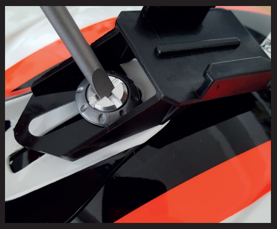
Use a screwdriver to turn the screw into the thread of the helmet.