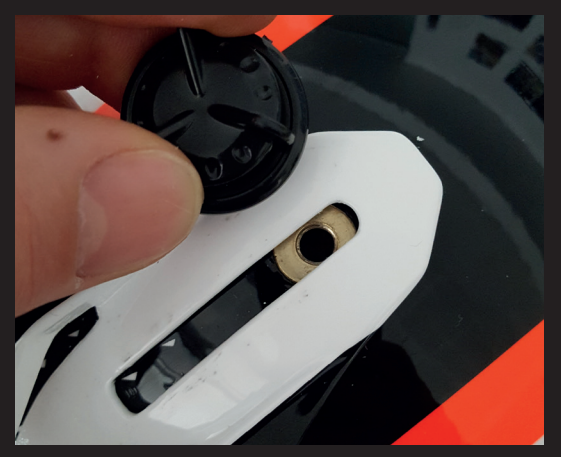
Remove the stock original screw on top of the helmet and replace it with the metal screw attached to the GoPro® mount.